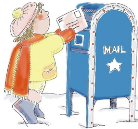
RA / GA Post Office