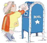
Cards for the Homebound